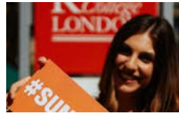
Kings Summer School