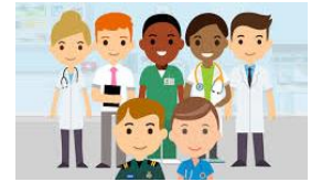
NHS Careers Competition